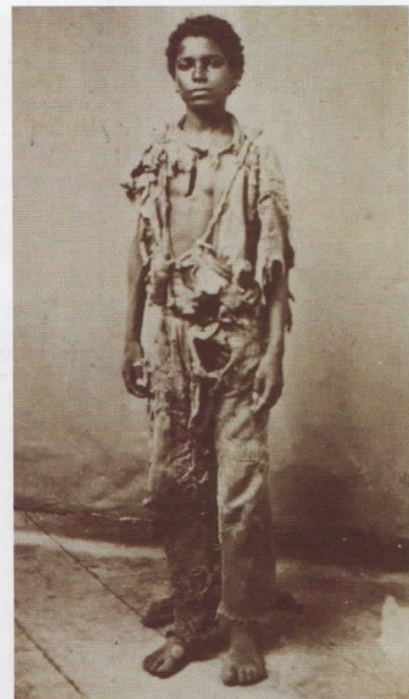
Runaway slaves like this boy faced many hardships. Harriet Tubman was one of the few abolitionists brave enough to go to the South and guide such runaways to freedom.